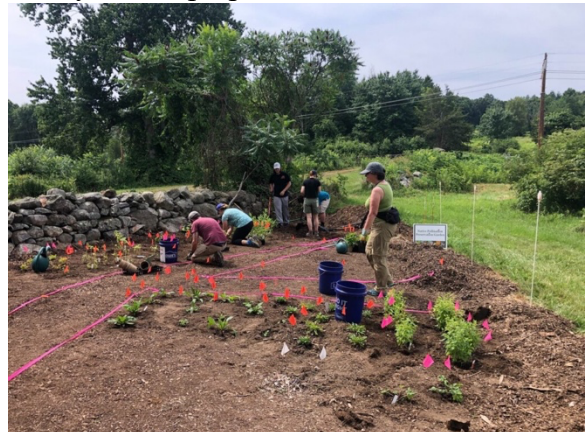
Volunteers begin planting at the Pollination Preservation Garden

SOLF is in the process of planting a pollination preservation garden at Beals Preserve Main Street Field. SOLF is partnering with the Open Space Preservation Commission (OSPC) as part of its plan to install pollination preservation gardens at various locations throughout Southborough such as the one planted last summer at the library. Some preparation work was done in