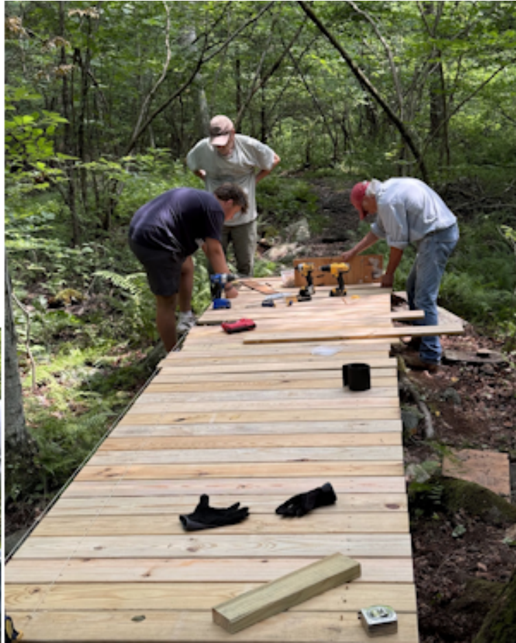
Above: Volunteers have been helping maintain SOLF trails for public access. You can still lend a hand this summer.

The Southborough Open Land Foundation shared news on recent volunteers who helped improve their trail access for public enjoyment.