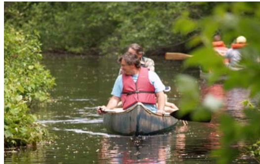
Canoeing the Sudbury