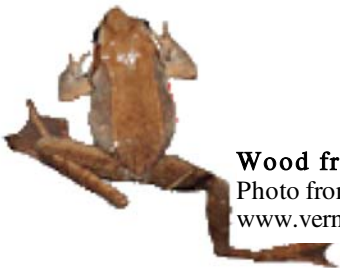
Wood frog