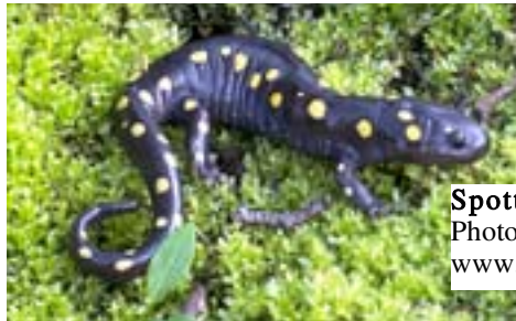
Spotted Salamander

On Wednesday, March 12 th , several members of SOLF were among those who gathered at the Town House to watch a fascinating slide show about vernal pools. The presentation, given by the Southborough Open Space Preservation Commission, focused on the importance of vernal pool habitats and why the species found there are important resources. It also touched on the importance of certifying vernal pools. The slide show included photographs of several certified vernal pools within the Breakneck Hill Conservation Area in Southborough. Included among the photos were some of the wood frog and the spotted salamander and their egg masses which are found in the vernal pools and are important in the certification process. Commission member Thad Soule shared his knowledge of vernal pools and gave tips on how to photograph the flora and fauna of these pools which often, but not always, dry out during the summer months.